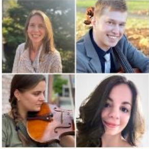
July 21, 2024 - 1 PM Lahoda String Ensemble